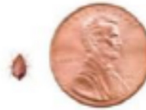
*Adult bed bug-actual size.

In 2013, the City of Chicago passed an ordinance to help address the growing problem of bed bugs. This ordinance provides that landlords and tenants share the responsibility in preventing and controlling bed bug infestations. Further, the ordinance requires that landlords provide an informational brochure on bed bugs to tenants. This informational brochure, developed by the Chicago Department of Public Health, is intended to meet this requirement.